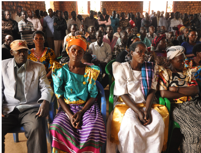
ASSEMBLY OF THE EVICTEES TO DISCUSS NEXT STEPS OF THEIR STRUGGLE FOR REDRESS (APRIL 2017)

Also in 2019, two interviewed evictees raised the same concern: “AIDS is on the increase; most young kids are infected; Kaweri Coffee Plantation gets workers from other parts of Uganda and they bring this disease.” According to one of these evictees, the health organisation Mildmay 62 has tested people in the area of Kaweri Coffee Plantation at least three times.