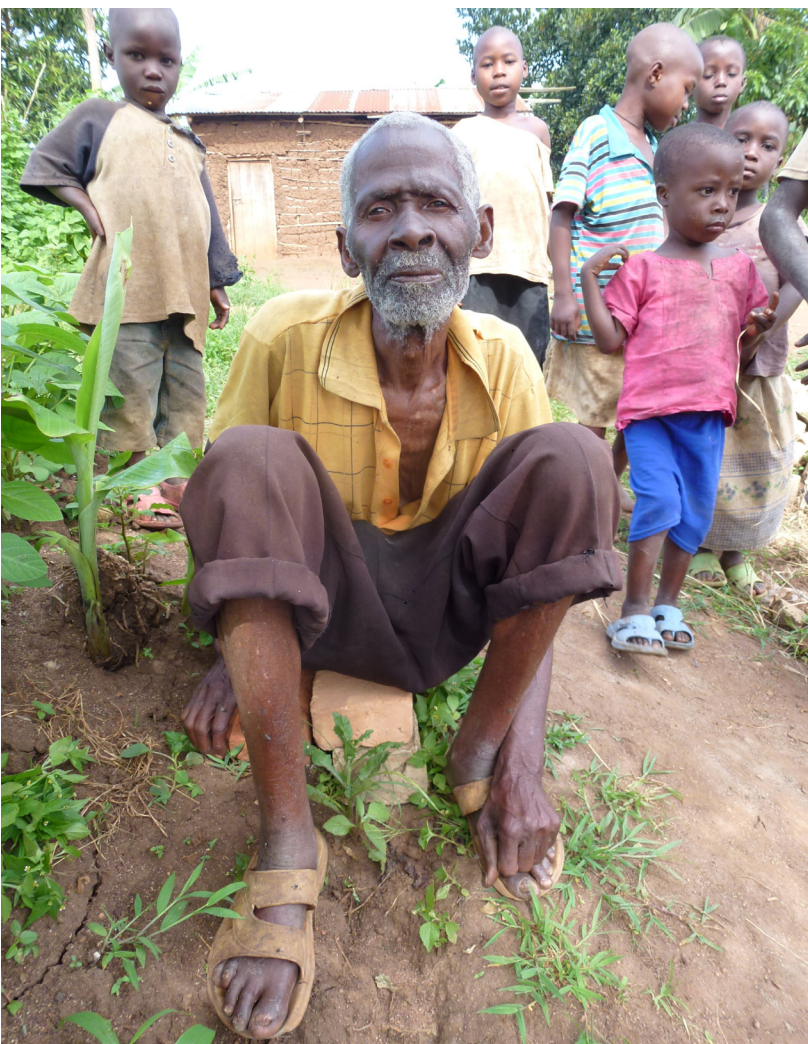
A STARVING OLD MAN, TOO WEAK TO WALK. (OCTOBER 2014)

“16 (a) Strengthen its legislation governing the conduct of corporations registered or domiciled in the State party in relation to their activities abroad, including by requiring those corporations to conduct human rights and gender impact assessments before making investment decisions;