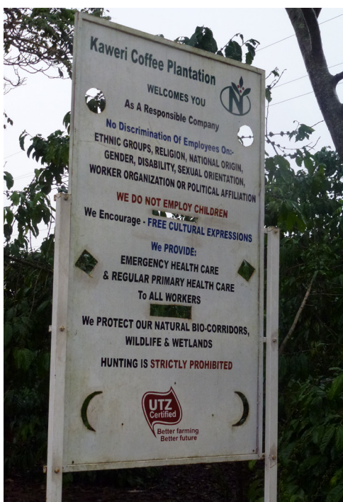
SIGNPOST AT THE ENTRANCE OF KAWERI COFFEE PLANTATION (AUGUST 2016)

fee Gruppe (NKG) based in Hamburg, Germany. According to FIAN's analysis the eviction was illegal. The eviction and its consequences have been thoroughly documented since 2002 4 by FIAN and others. 5 The event was described by the evictees as particularly cruel. During FIAN's visit in August 2016, various women testified about what happened: "When we were evicted from the land we ran with my husband and life was too hard for both of us and my husband died leaving me with five children. After his burial, my elder daughter also followed due to severe sickness that resulted from the miserable conditions we lived in. During that time, I lost three children and those that had remained also ran away from the village and left me with grandchildren...".