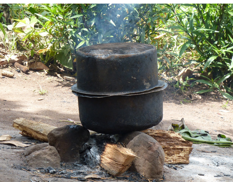
OUTDOOR-KITCHENS ARE COMMON IN KYENGEZA. SOMETIMES, HUNGRY PEOPLE STEAL FOOD OUT OF THE COOKING POTS.

The lack of land makes food production even more vulnerable to harsh weather conditions. In 2014, a woman said: "Recently, we were affected by a hailstorm: the cassava went sour, the sweet potatoes rotted. Right now, due to the hailstorm, we face hunger because we don't have enough food." In 2019, the families interviewed also complained of hunger due to lack of rain and a hailstorm. The headmaster of New Kitemba Primary School listed lack of land as one reason why parents are not able to cover costs of schooling for their children.