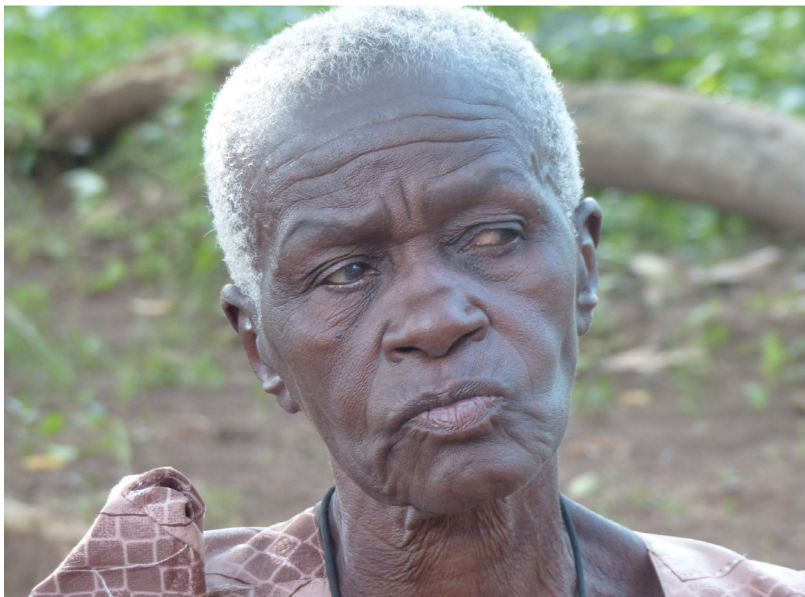
ELDERLY EVICTED WOMAN DEMANDING COMPENSATION. (NOVEMBER 2013)

FIAN will continue to support the evictees in their human rights-related demands as they struggle against Uganda and Germany for the breaches of human rights obligations these states have committed, and against Kaweri/NKG Coffee Plantation for their human rights abuses.