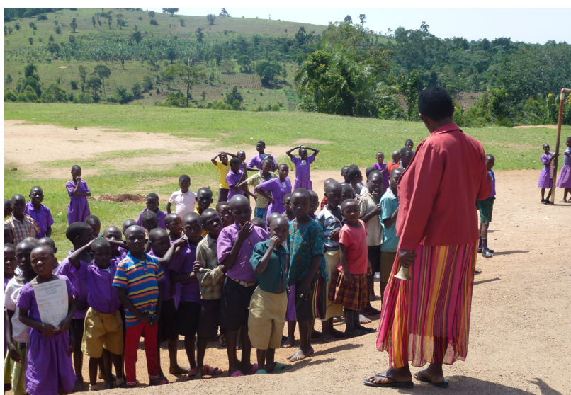
MANY PUPILS OF NEW KITEMBA PRIMARY SCHOOL CANNOT AFFORD SCHOOL UNIFORMS. (AUGUST 2017)

According to General Comment 14 68 of the CESCR, the right to health includes the right to a system of health protection which provides equality of opportunity for people to enjoy the highest attainable level of health. In this regard, the State of Uganda has breached the right to health of its citizens. The African Charter on Human and Peoples' Rights (Art. 16) 69 requires States to take necessary measures to protect the health of their people and to ensure that they receive medical attention when they are sick. In this regard, the state of Uganda failed as well.