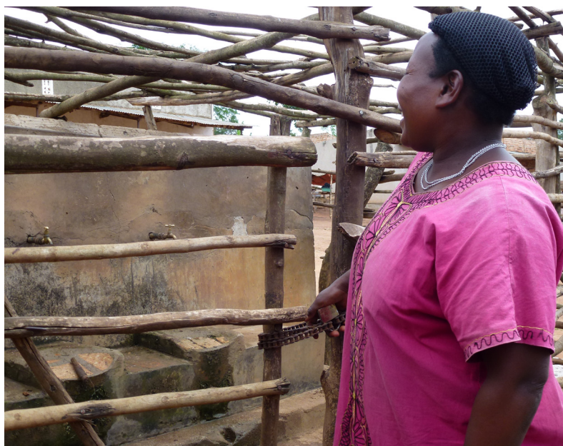
THE FENCE OF THE WATER TAPS IN KYENGEZA IS LOCKED. (MARCH 2014)

According to Article 14 paragraph 1 of the UN Covenant