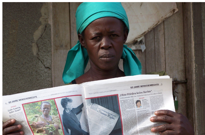
EVICTED WOMAN HOLDS GERMAN NEWSPAPER WHICH HAD REPORTED HER STORY.

On 30 January 2017 statements of the interviewees which referred to Kaweri Coffee Plantation Ltd. were sent to the headquarters of the Neumann Kaffee Gruppe (NKG) in Hamburg for comment. NKG answered on 22 February 2017 and denied all statements and accusations against them. To verify the information provided by the evictees, two researchers investigated some of the issues in question again, interviewing 27 women and a police officer in Kyengeza on 2 August 2017. On 24 to 25 August 2017 another researcher assisted by an interpreter and accompanied by a journalist interviewed the headmistress of the