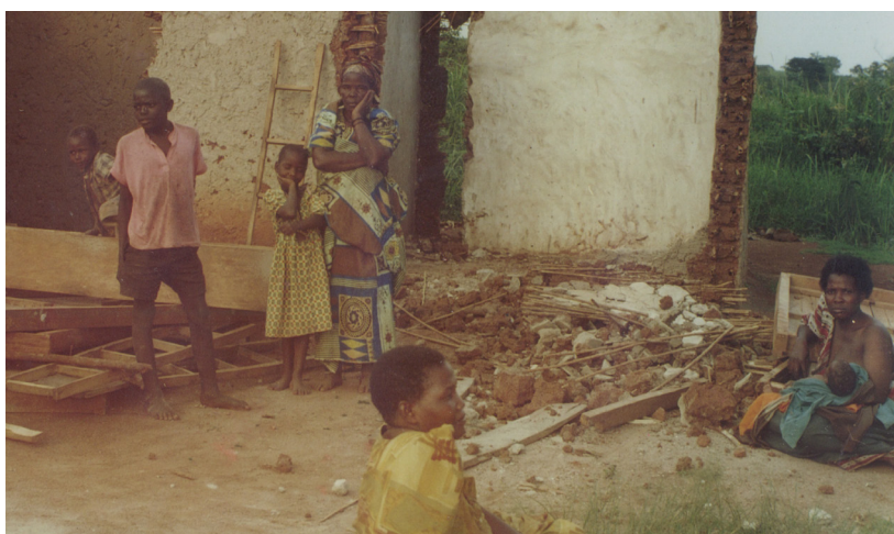
FAMILY IN FRONT OF THEIR DESTROYED HOUSE IN AUGUST 2001

At the hearing on 1 July 2019, the judge ordered a mediation between all parties involved in the court case. While the Government of Uganda has offered 1,907,285,000 Ugandan Shillings (UGX) as compensation for all plaintiffs (401 families), the plaintiffs demand to be compensated by 3,814,570,050 UGX for special damages plus by 30 million UGX per family to enable them to buy ten acres of land. By making that demand, the evictees of Block 99 have abandoned their previous hopes of getting their land back and have given up their claims to the land. 9 Those who have been evicted from Block 103 have chosen to continue trying to get their land back. 10