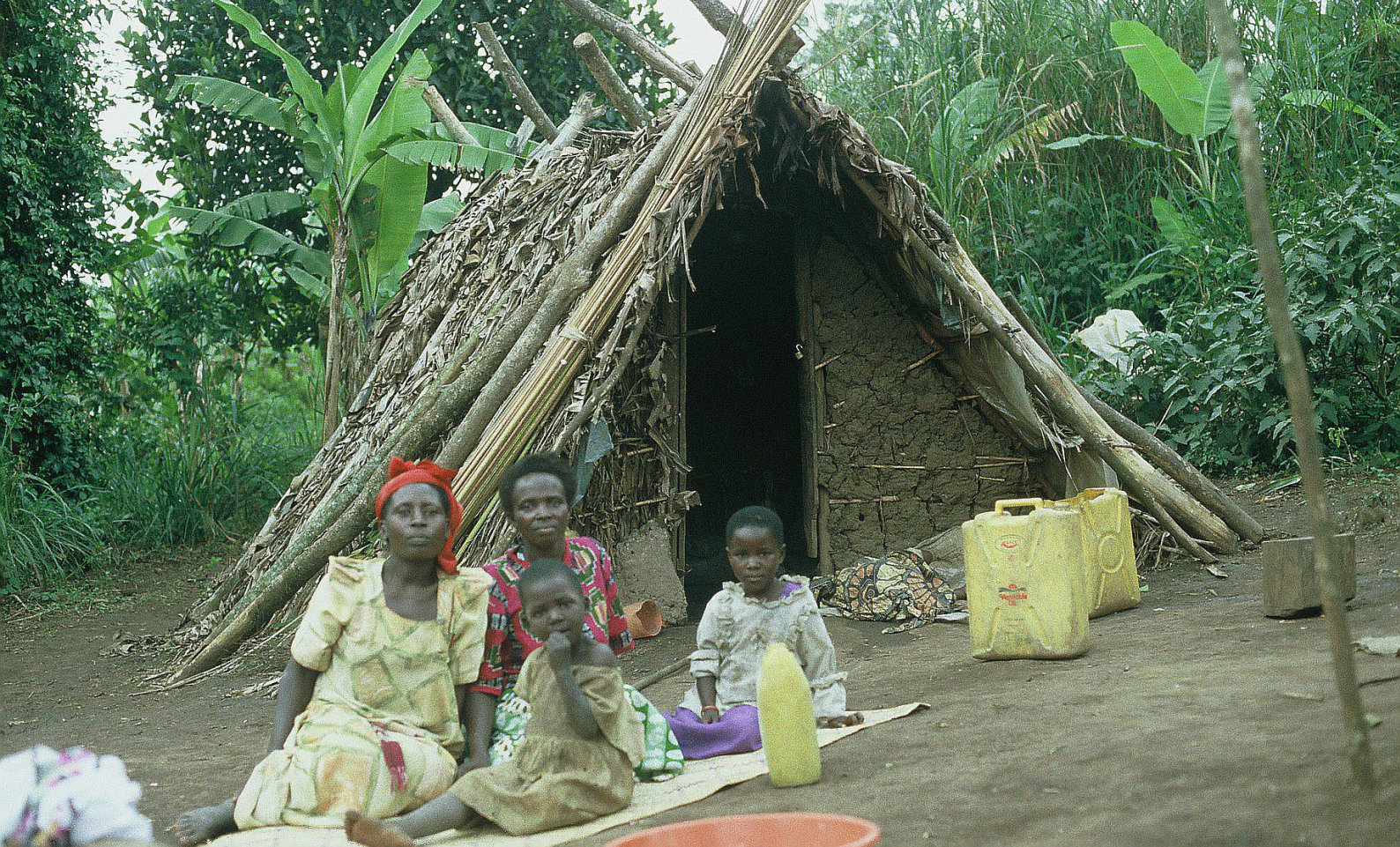
IN AUGUST 2003, TWO YEARS AFTER THE EVICTION, FAMILIES STILL LIVED IN MAKESHIFT SHELTERS.