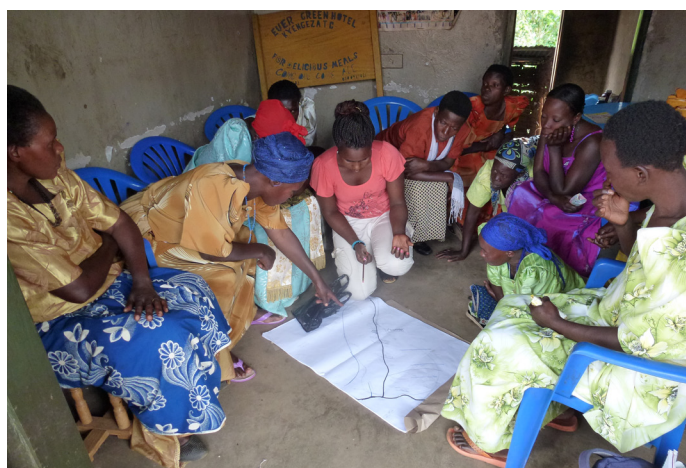
WOMEN SHOW ON A MAP WHERE THEIR COMPOUNDS HAD BEEN LOCATED BEFORE THE EVICTION. (OCTOBER 2014)

In 2016, three health centres and one hospital in the area, namely Kanseera Health Centre, Madudu Health Centre