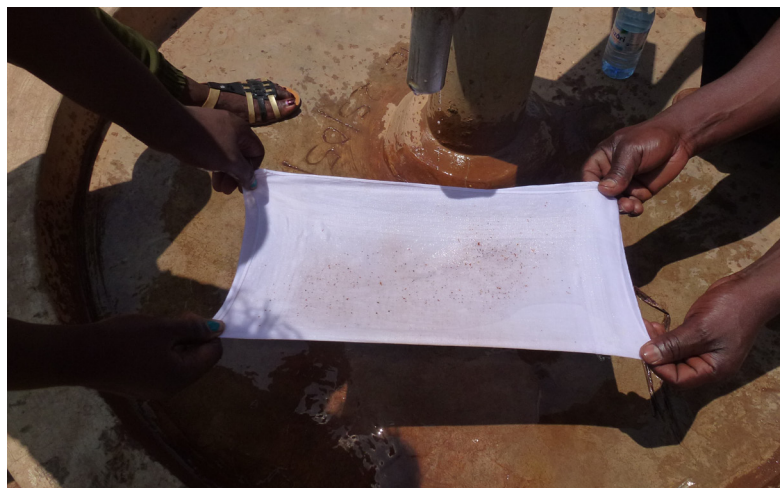
WATER WITH DARK PARTICLES COMING OUT OF THE BOREHOLE IN LUWUNGA. (AUGUST 2017)

In 2004, after FIAN's intervention, Kaweri/NKG built a pipeline going from the plantation to Kyengeza. However, for many years the water only ran sporadically and was not supplying enough water for the evictees. In 2019, the pipeline was closed completely. Women now have to walk long distances to collect potable water. 50 Elderly women reported that they cannot carry water for this long a distance. They either have to pay someone to carry water for them or they have to use unsafe water sources 51 .