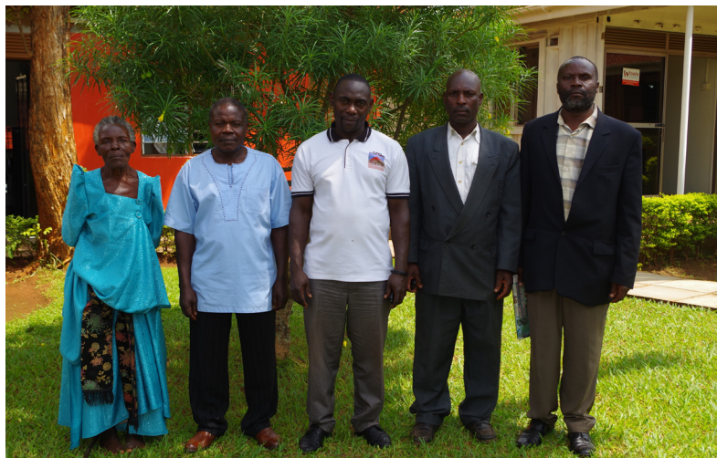
THE FIVE EVICTEES WHO HAVE SUED THE GOVERNMENT OF UGANDA AND KAWERI COFFEE PLANTATION LTD., REPRESENTING 401 FAMILIES. (JULY 2019)

In 2016, one woman said: "The majority of our girls have gotten married at the ages of fourteen, fifteen or sixteen; the average is sixteen years because they were idle and didn't attend school."