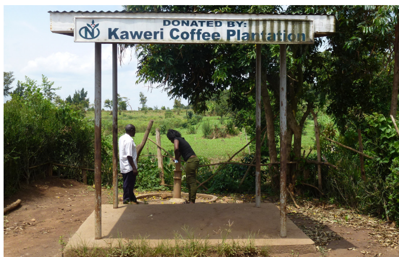
DRIED BOREHOLE IN KIFUFU. (AUGUST 2017)

According to the interviewees this situation has not changed, even though they have two new boreholes; according to them, these boreholes provide dirty water. Diarrhoea is widespread because of the lack of access to clean drinking water and sanitation. Furthermore, women and children have to walk long distances to fetch water.