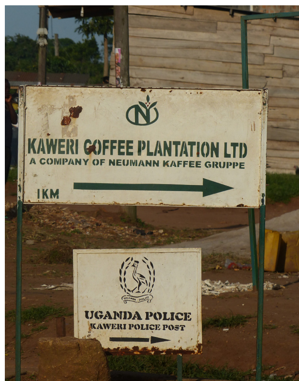
KAWERI COFFEE PLANTATION IS SUPPORTED BY THE UGANDAN STATE

5. Since 2004, through letters or during personal meetings, the evictees have asked the German government several times for support, but the government has not responded. 17