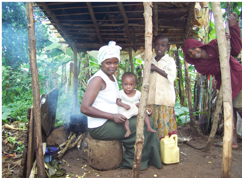
THE WOMAN LOST TWO SIBLINGS DUE TO THE EVICTION.

did this because they couldn’t sustain themselves either, so they were forced to leave their children and went to look for some work to do in other places. Children go a long time without eating food. For example, we have children who go almost a day without eating. The experience of hunger is the same for boys and girls. So, due to starvation, children move around the community looking for things to eat and this has led many to join peers that have greatly affected them. They have learned how to use marijuana, and most of the youth now in Kyengeza are drug addicts.”