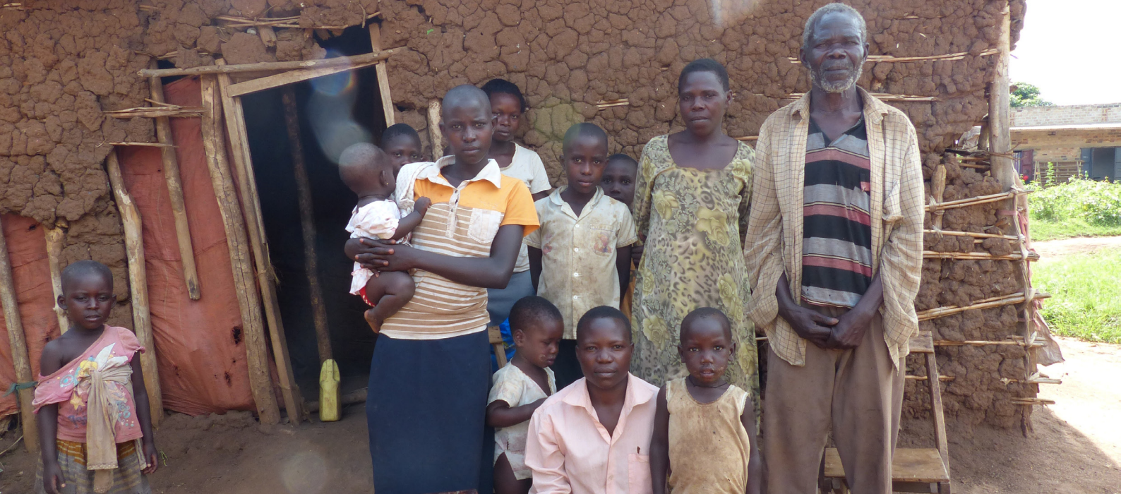
SINCE THE EVICTION, MANY FAMILIES LIVE IN HOUSES OF POOR QUALITY. (NOVEMBER 2013)

tricht principles: 24) to ensure that the right to water of the evictees is not abused by the actions/omissions of NKG. The Maastricht principle 24 should be interpreted together with principle 25 (c) and these go hand in hand with principle 32 (a) which states: "In fulfilling economic, social and cultural rights extraterritorially, States must: a) prioritize the realization of the rights of disadvantaged, marginalized and vulnerable groups".