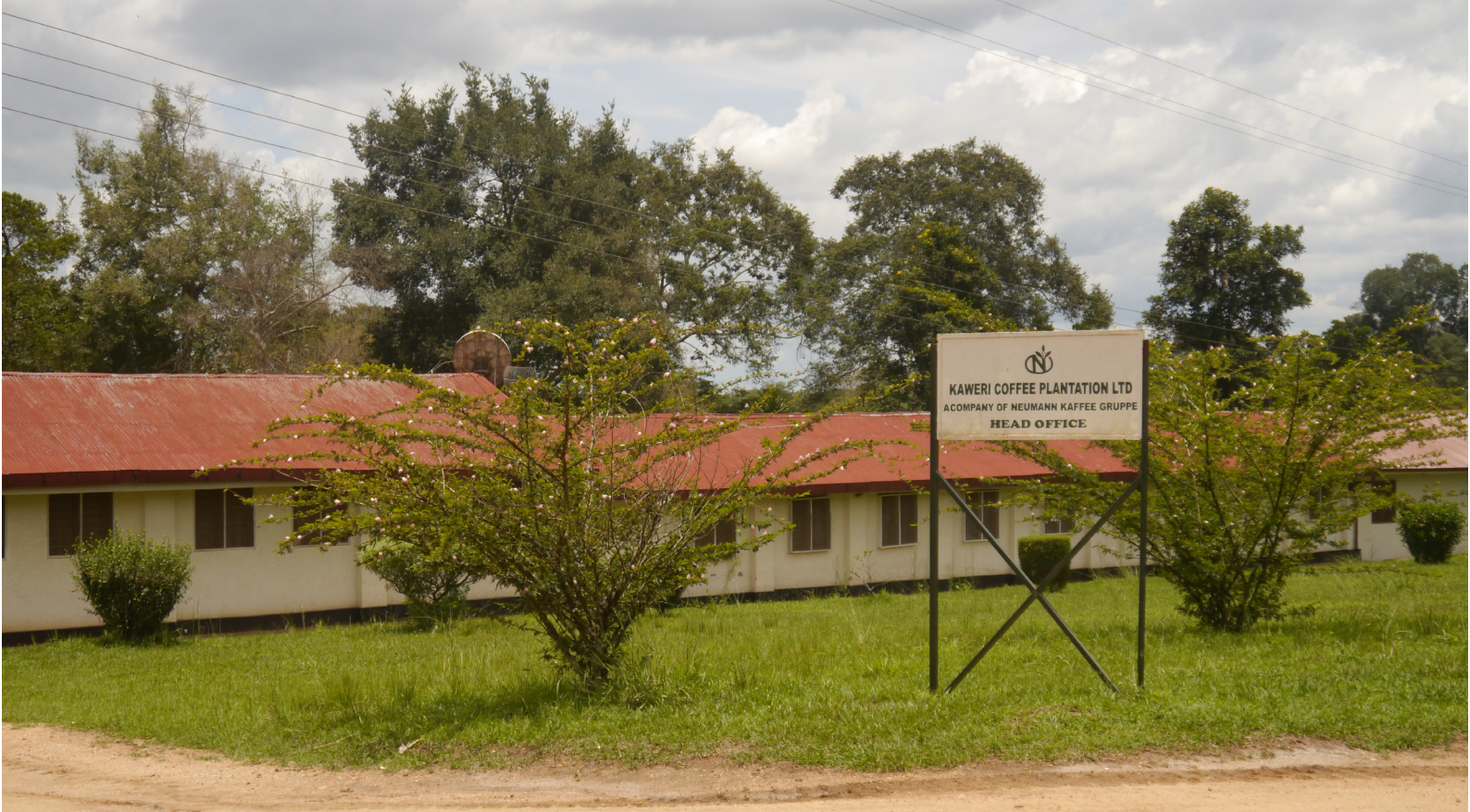
THE FORMER KITEMBA PRIMARY SCHOOL HAS BEEN TRANSFORMED INTO THE HEADQUARTER OF KAWERI COFFEE PLANTATION (MARCH 2013)

Consequently, in 2017, in its concluding observations, the CEDAW committee has recommended that Germany: