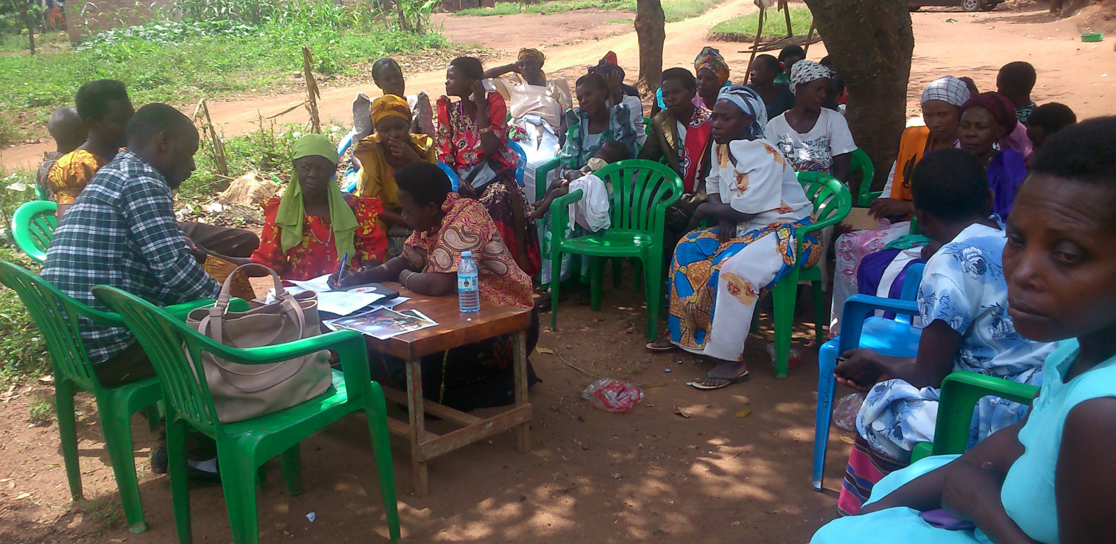
WOMEN REGISTER BEFORE A FOCUS GROUP DISCUSSION. (AUGUST 2017)

to work on the plantation only during school holidays 79 , during which time they would pick coffee. She said that almost 80% of the pupils of P3 to P7 who are 12/13 years old would work on the plantation during school holidays.