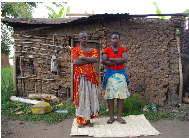
THE FAMILY DOES NOT HAVE MEANS TO REPAIR THE BROKEN HOUSE (JULY 2019)

He had to work from 7 am to 1 pm but he did not have a working contract. While his tools were provided by the plantation, he did not get protection gear. He was not aware of a complaint procedure at the plantation and addressed complaints only to his supervisor. He complained about the low salary paid by the plantation, which was not enough to sustain his family. He needed to spend 6,000 UGX per day for food and 15,000 UGX per month for renting a one-room house. When asked what he would request for a salary, he answered 8,000 – 10,000 UGX per day (equivalent to 2,00 - 2,50 €).