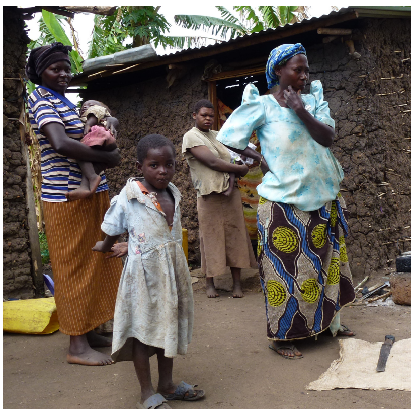
WOMAN AND CHILDREN ARE ESPECIALLY AFFECTED BY THE IMPACT OF THE EVICTION (FEBRUARY 2014)

tion 39 (Article 26, 29 (2-a) and 237 (1, 3-a, 8) which highlights that no person shall be compulsorily deprived of property unless it is necessary for public use or in the interest of defence, public safety, public order, public morality or public health and which requires that, prior to the repossession or acquisition of property, prompt payment of fair and adequate compensation has to be made. In addition, many of the evictees were lawful customary tenants who are guaranteed security of oc-