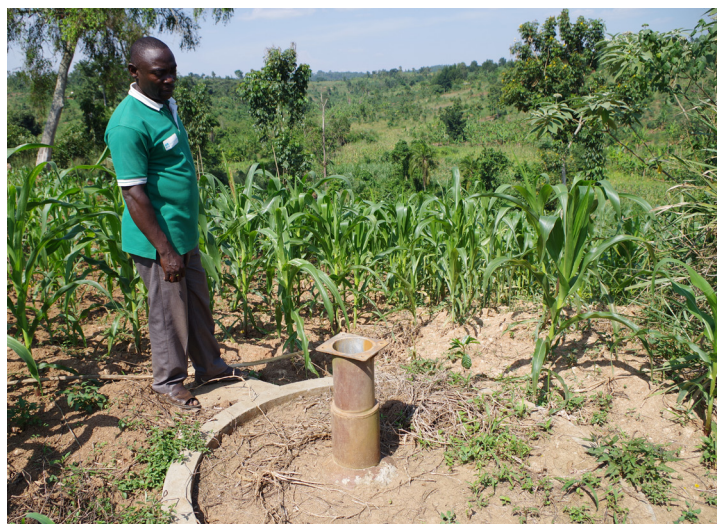
ABANDONNED BOREHOLE. (JULY 2019)

Germany has violated its extra-territorial obligations by not regulating NKG/Kaweri Coffee Plantation Ltd. (Maas-