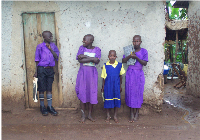
MANY PUPILS DO NOT EVEN HAVE SHOES. (MARCH 2006)

2010 to construct P6 and P7. Most of the children stopped at P5 and started working at the Kaweri plantation though it claims not to employ children. Very few parents could afford taking children to boarding schools or to relatives because the nearby schools are ten to fifteen kilometres away from Kyengeza. The consequences of finishing the school in P5 for the first nine years after the eviction is that a lot of children did not have a chance to go to secondary school and ended up working in the Kaweri coffee plantation - more so in the coffee picking season, though it's hard to see them during the ordinary work times since there are no collection centres for picked coffee cherries during this time. The children are paid according to the kilograms of coffee that they pick. Formally, every kid was paid 3,200 shillings, but this amount was raised a little bit to about 4,000 shillings, depending on the day's work. They (Kaweri/NKG) measure the area you have to work on. If you do not finish the work in a day, the money is